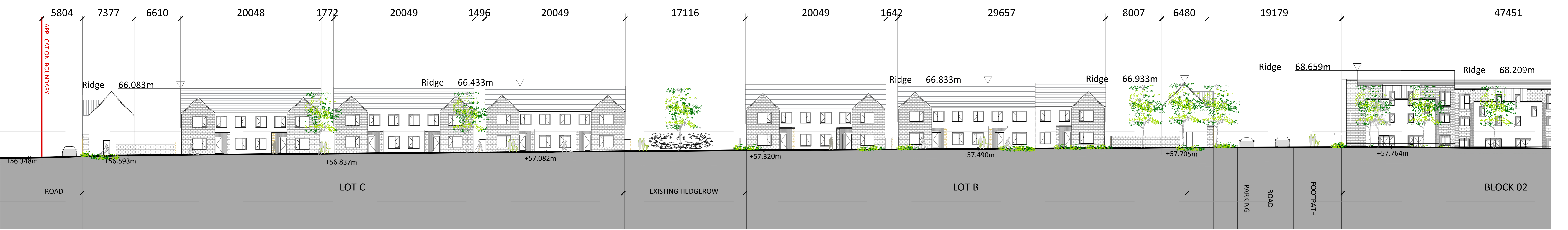
PART SECTION C-C: 1:200