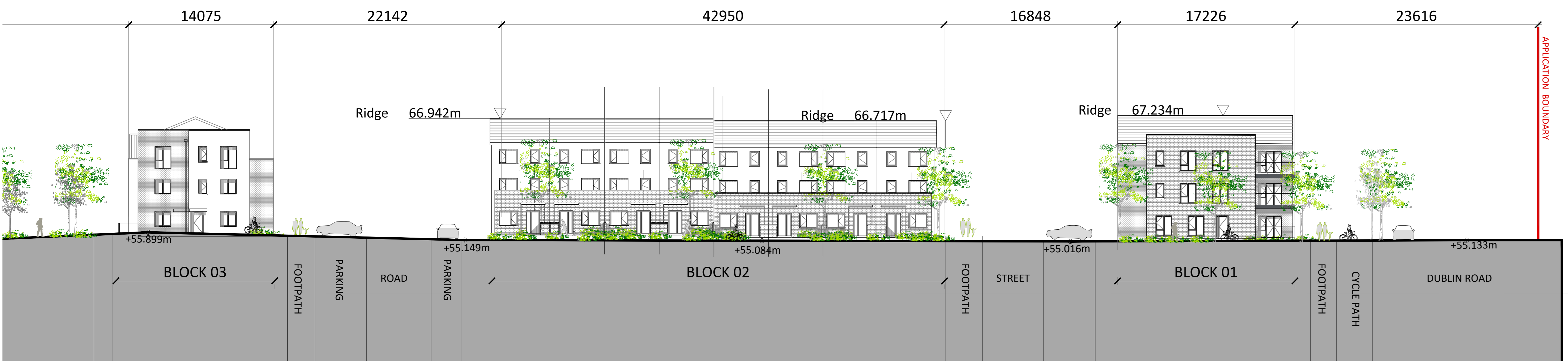
SECTION C-C: 1:200