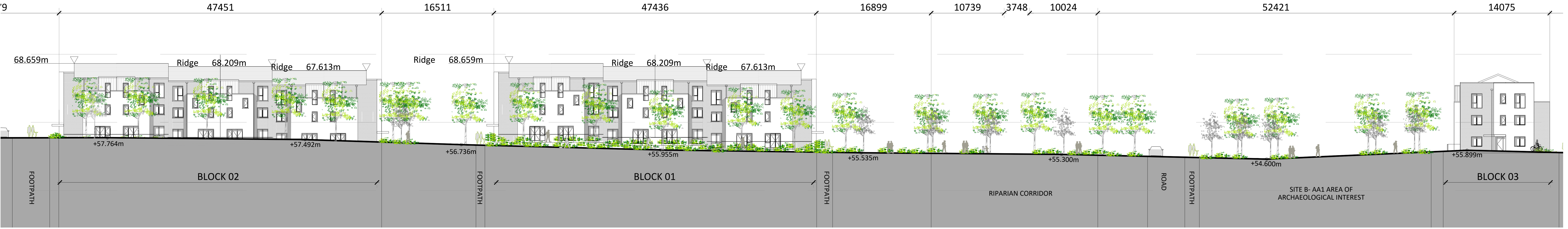
PART SECTION C-C: 1:200