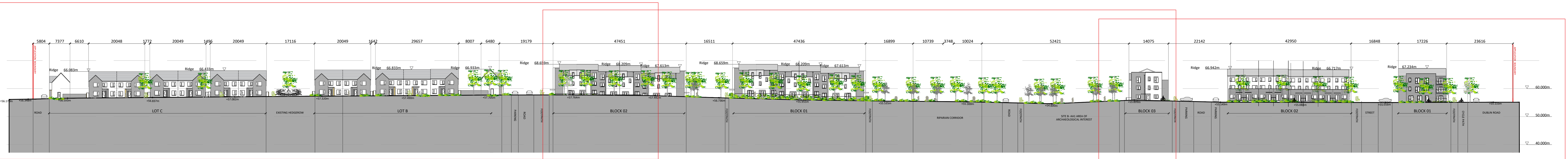
CONTEXTUAL ELEVATION ALONG MAIN AVENUE - SITE B/C SECTION C-C: 1:500